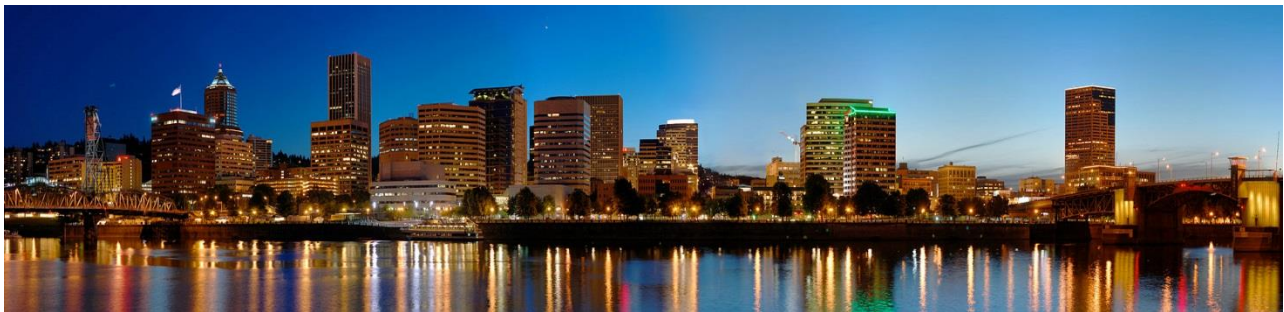
Portland Skyline at night

*If a holiday falls on a Sunday, the day following is observed as the legal holiday.