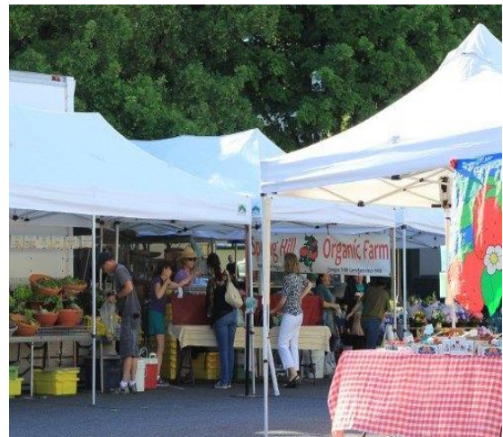
Portland Farmers Market