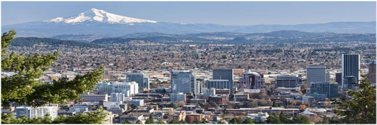
Photo of Portland

Big city excitement and small town charm makes Portland, known as "the City of Roses," a favorite destination. Portland is situated approximately 70 miles from the Pacific Ocean where the Columbia River meets the Willamette River, has a magnificent setting, combining waterways with lush greenery rarely found in urban settings.