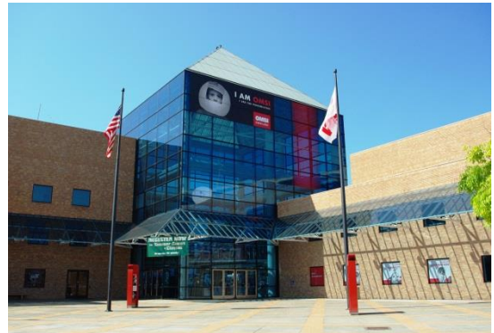
Oregon Museum of Science and Industry