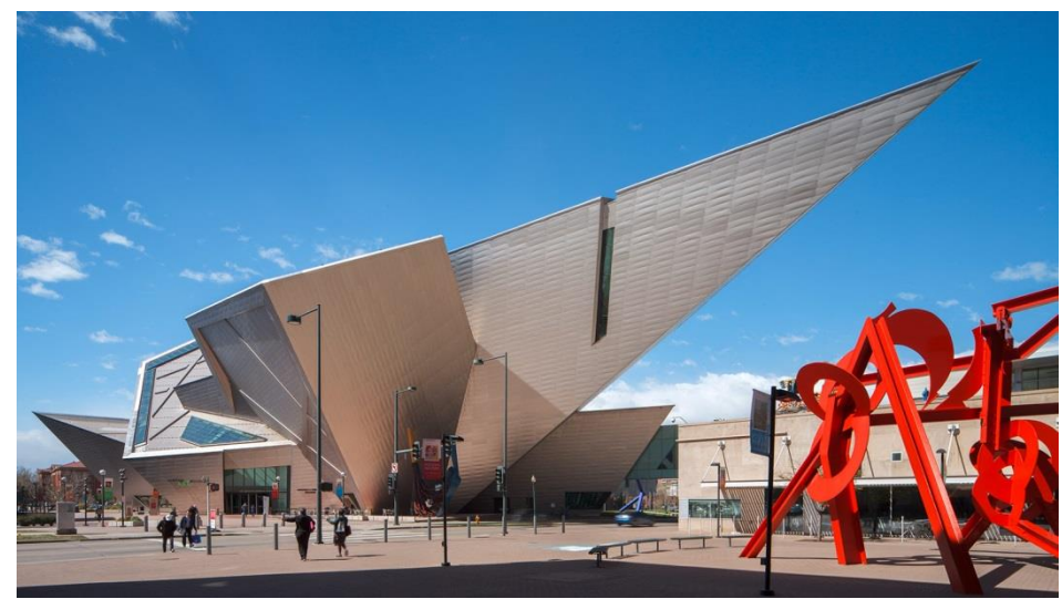
Denver Art Museum

delight and inspire. Don't miss Lawrence Argent's massive <u>Blue Bear</u> (already a Denver icon) at the Colorado Convention Center, or the many Old West-themed sculptures in <u>Civic Center Park</u>.