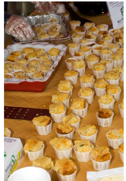
Cornbread Festival