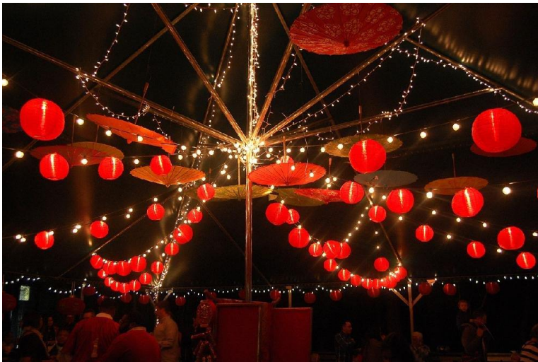
Wildwood Deep Winter Festival