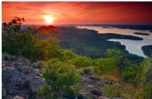
View from Pinnacle Mountain Park Summit