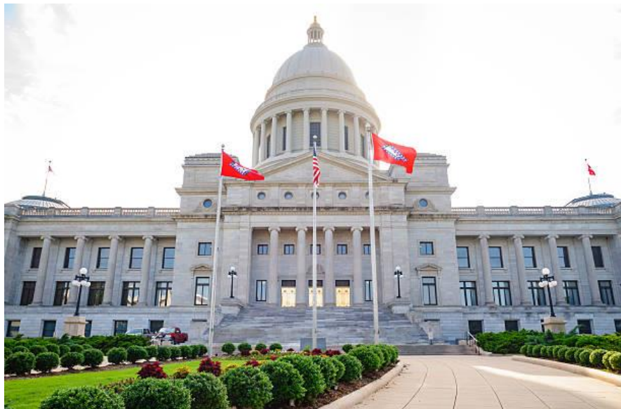
State Capitol Building