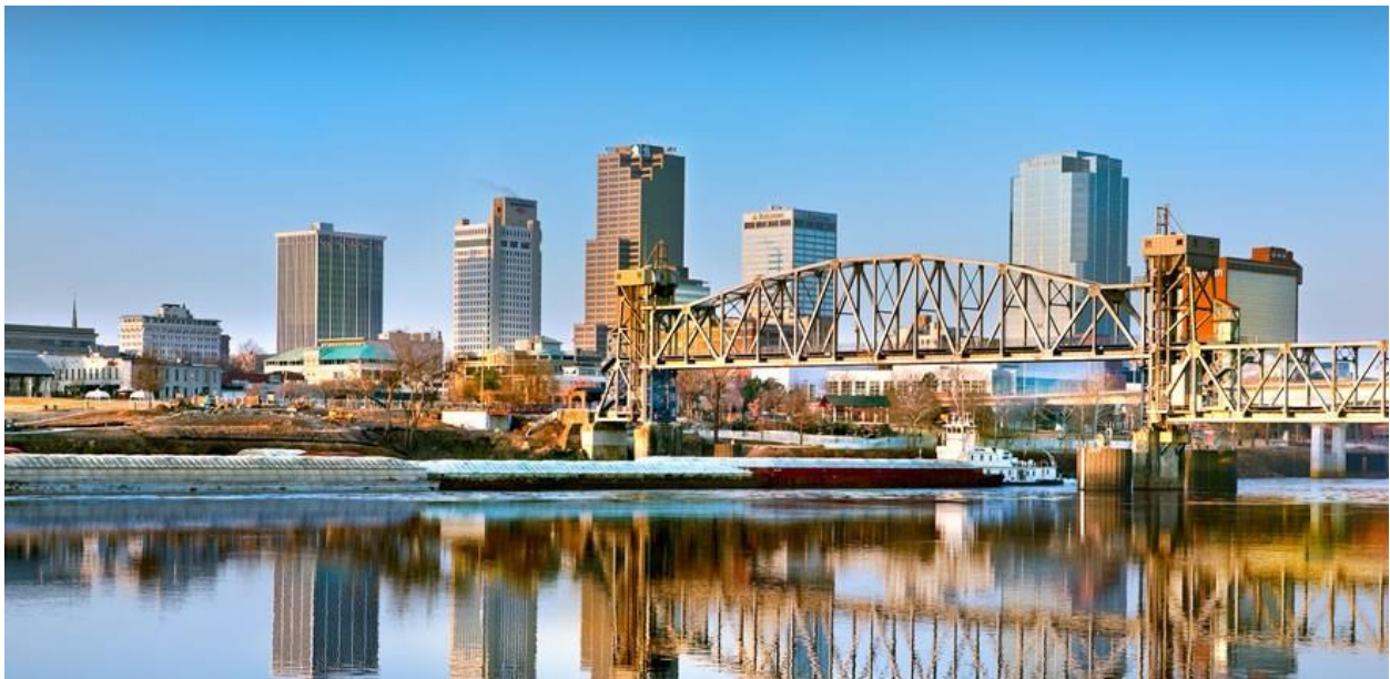
Little Rock Skyline

*If a holiday falls on a Sunday, the day following is observed as the legal holiday.