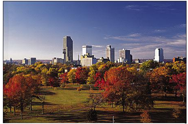
Little Rock Arkansas

Little Rock is the capital and the most populous city in Arkansas. It is also the county seat of Pulaski County. It was incorporated on November 7, 1831, on the south bank of the Arkansas River very near the geographic center of the state. The city derives its name from a rock formation along the river, named "La Petite Roche" by the French in 1799.