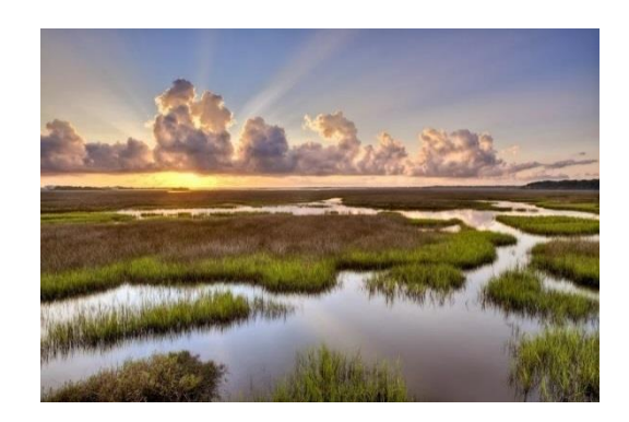
Timucuan National Park