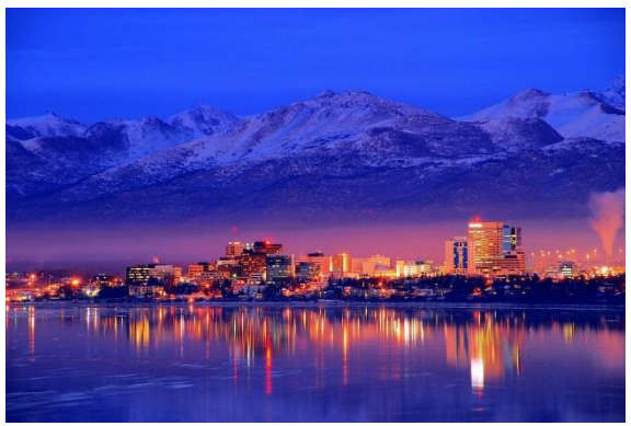
Anchorage Alaska Skyline

Known for the abundance of outdoor activities and natural beauty, <u>Anchorage</u> is a city that balances a thriving metropolitan area with beautiful scenery. The residents enjoy visiting the national parks, observing glaciers, seeing a vast amount of wildlife, and biking the many trails. If enjoying the great outdoors isn't your go-to activity, there are plenty of art exhibits, fine restaurants, and downtown entertainment in the area as well.