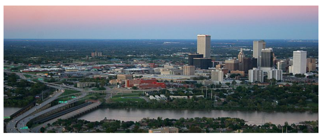
Tulsa Skyline

Tulsa is the second-largest city in the state of Oklahoma with a population of 403,090 and the county seat of Tulsa County. The Metropolitan Area has a population of 981,005 and the Combined Statistical Area population is 1,151,172, leading this county to be the most densely populated in the state. Tulsa was known as the "Oil Capital of the World" for it was a vital city for the American oil industry. In the past, the city relied on its energy sector in order to thrive, but in recent years, the city has diversified its economic sectors to include finance, aviation, technology, and telecommunication. Tulsa is also known as the cultural and arts center of Oklahoma with its wide variety of art deco architecture, art museums, opera, and more.