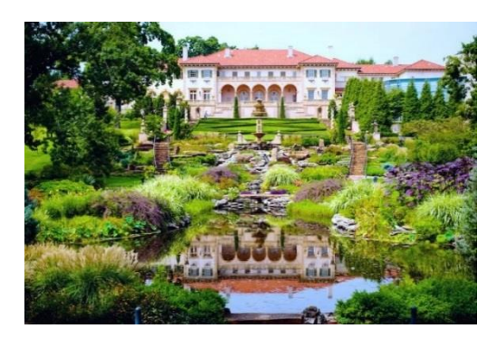
Philbrook Museum of Art