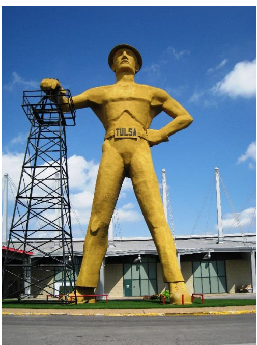
The Golden Driller