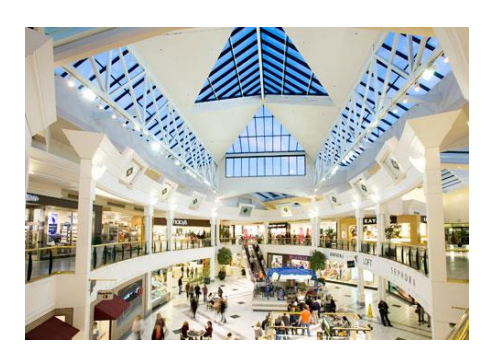
Mall at Green Hills