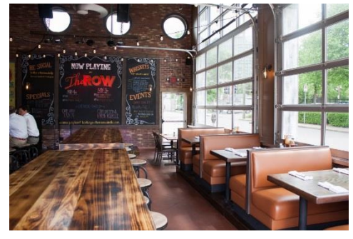
Nashville Dining Scene