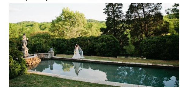
Cheekwood Botanical Garden