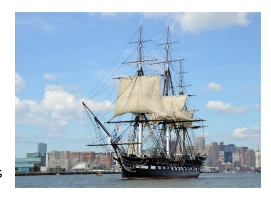
USS Constitution