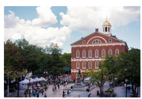
Faneuil Hall