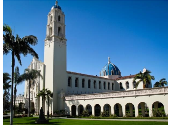
University of San Diego