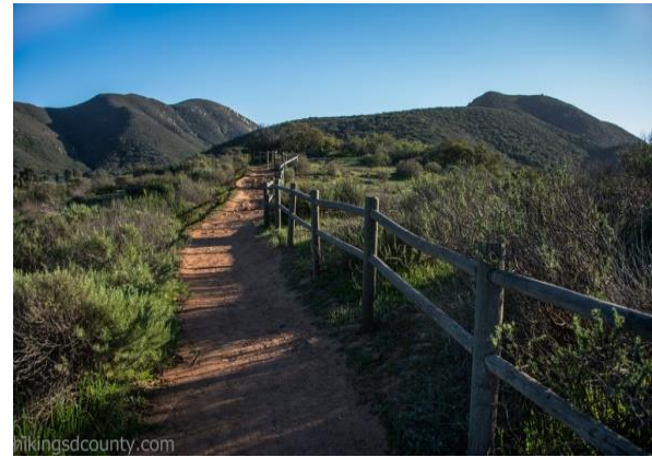
Mission Trails Park

All dogs shall be maintained on a leash not to exceed 8 feet, including trails and canyons in all parks. For those parks that have been designated dog off-leash areas , dogs must be leashed until inside the posted boundary for the off-leash area. By law all dogs must be licensed .