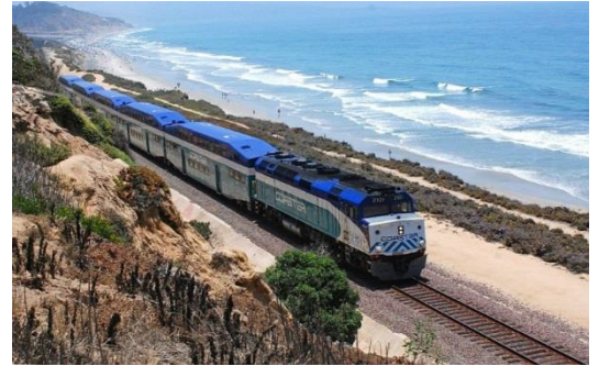
San Diego Coaster

COASTER : The COASTER commuter train provides breathtaking coastal scenery as it runs north and south through San Diego County, serving eight stations between Oceanside and downtown San Diego. More than 20 trains run on weekdays, with additional service on the weekends. It takes about an hour to travel the entire COASTER route.