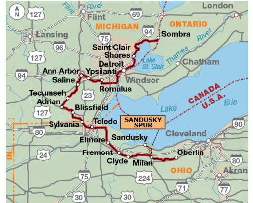
Bike Trails courtesy of Adventure Cycling

AAA is a membership organization that offers benefits such as roadside service and towing, discounts on car products and services, maps, reference materials, etc. Call 1-800-352-5382 for information.