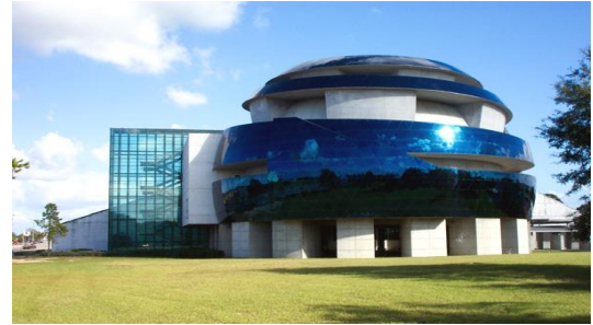
Science and Industry