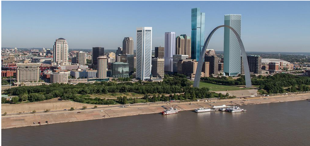
St. Louis Skyline

St. Louis, named for King Louis IX of France, was founded in 1764 as a French fur-trading village by Pierre Laclède. Prior to European settlement, the area was a major regional center of Native American Mississippian culture. When Thomas Jefferson signed the Louisiana Purchase in 1803, St. Louis was already a 40-year-old river town.