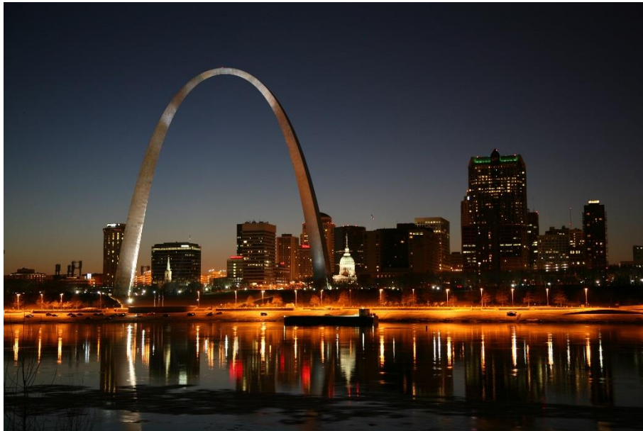
St. Louis skyline at night

*If a holiday falls on a Sunday, the day following is observed as the legal holiday.