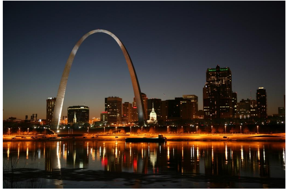
St. Louis skyline at night