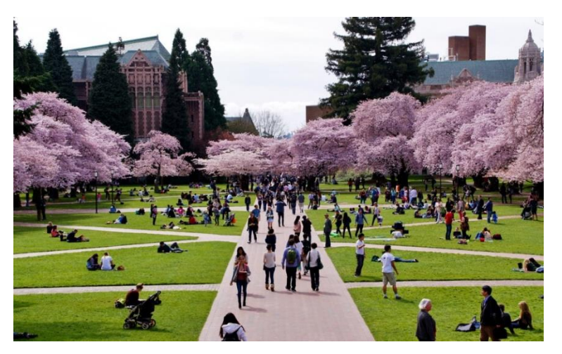
University of Washington