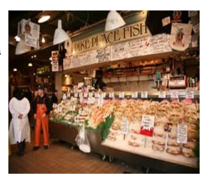
Pike Place Fish Market