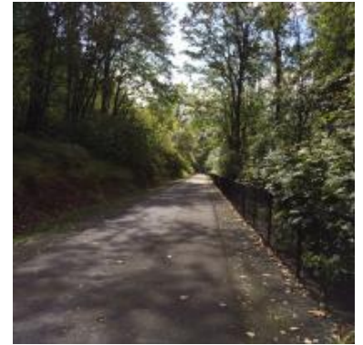
Sammamish River Trail

Centrally located between Seattle, Bellevue, and the Sammamish River Valley, Redmond is in the heart of the area's finest attractions. The city's expansive parks and endless trails are perfect for outdoor activities, and Redmond Town Center , the city's largest shopping complex, has over 110 shops, restaurants, and entertainment experiences to explore. Nearby Woodinville wineries offer scenery and tasting rooms. For the climbing enthusiast, area indoor climbing walls provide the ultimate fun!