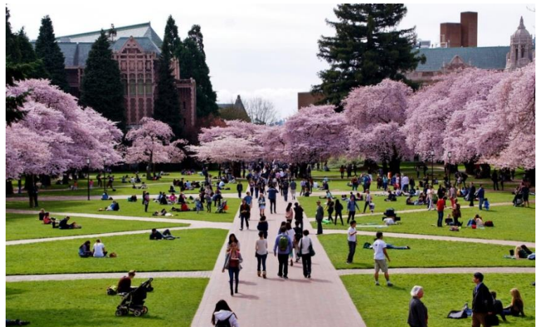
University of Washington