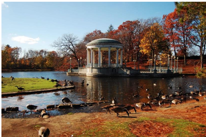
Roger Williams Park