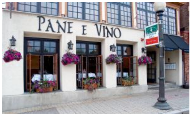
Pane E Vino