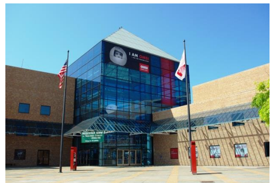
Oregon Museum of Science and Industry