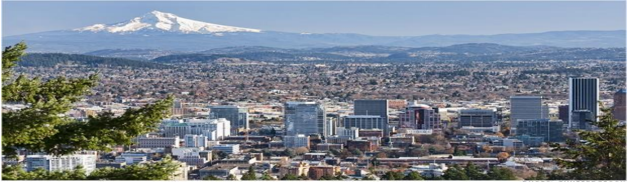
Photo of Portland

Big city excitement and small town charm makes Portland, known as "the City of Roses," a favorite destination. Portland is situated approximately 70 miles from the Pacific Ocean where the Columbia River meets the Willamette River, has a magnificent setting, combining waterways with lush greenery rarely found in urban settings.