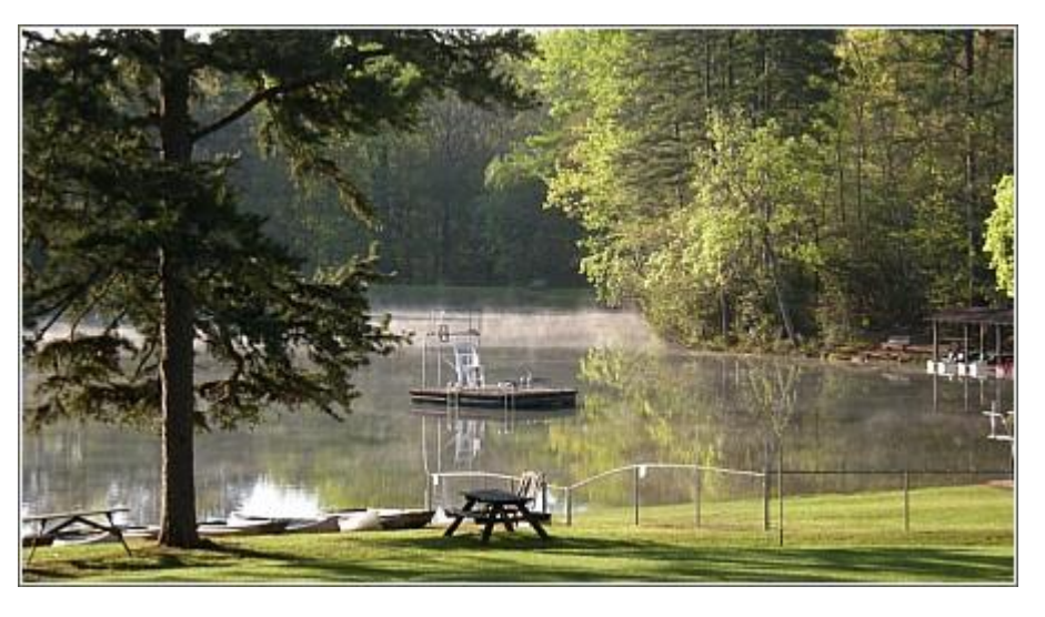
Oconee State Park

Adopt a pet from Oconee County Humane Society.