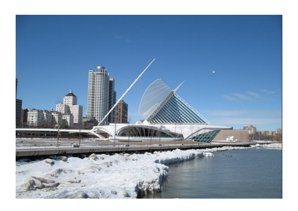
Milwaukee Art Museum