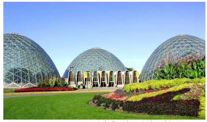
Mitchell Park Horicultural Conservatory