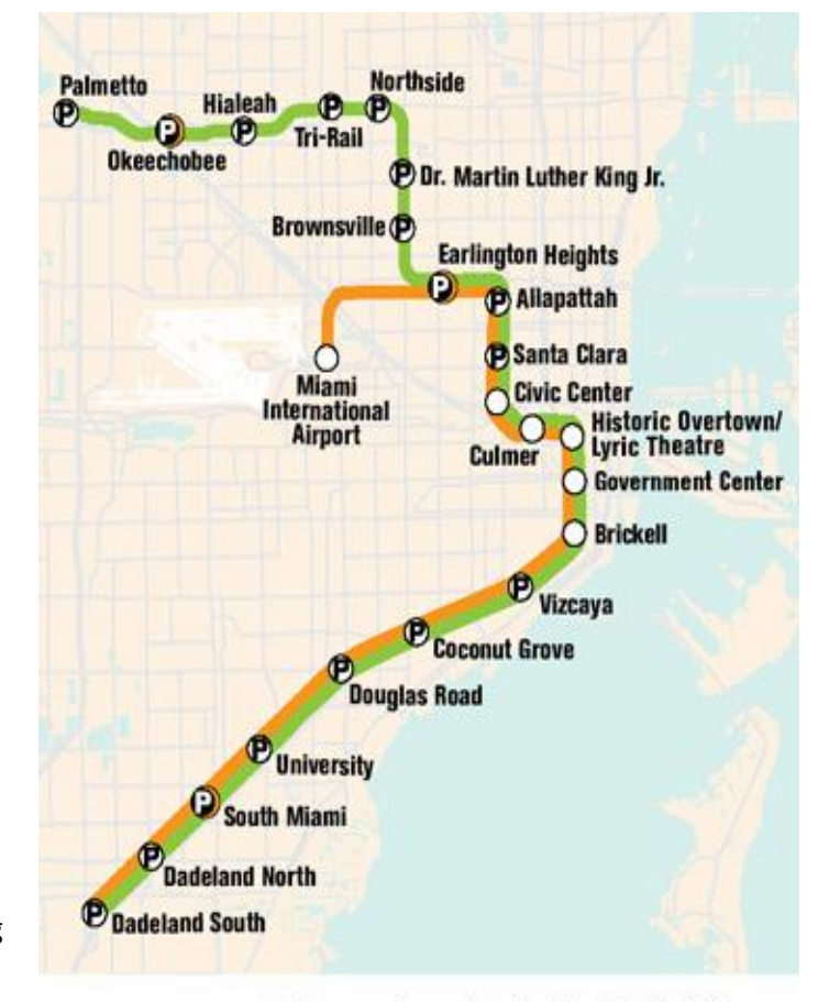
Station with Overnight/Long-Term Parking Miami Metrorail Map Courtesy of MiamiDade.Gov

<u>Transit Fares</u> for Metrobus and Metrorail may be discounted when a monthly pass is purchased.