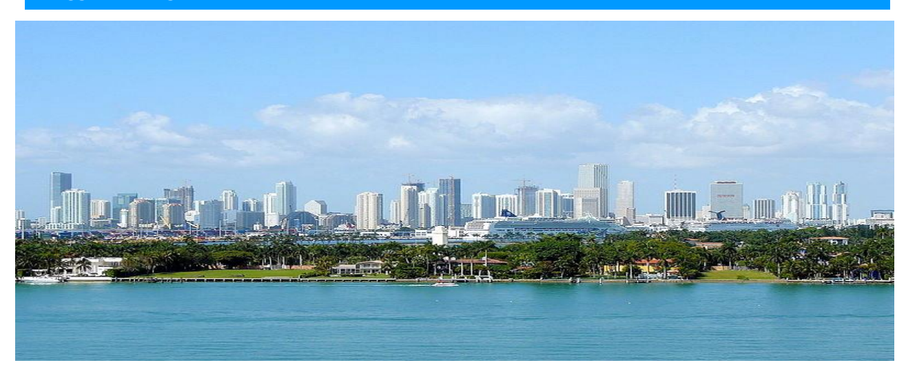
Miami skyline

The history of Miami reveals that the city gets its name from the word "Mayaimi", meaning big lake in the local Native American language and is thought to be referring to Lake Okeechobee. The area was first occupied by The Tequestas when the first European ships landed on the coast of South Florida. A Spanish explorer named Ponce de Leon came in search of the fountain of youth and later claimed the place for his native country Spain. Florida remained under the control of Spain for almost two and a half centuries. The Spanish introduced modern weaponry and brought with them diseases that caused the native Tequestas to disappear. In 1818, the Seminole Indian Wars started and following its conclusion, the United States bought Florida from Spain in 1821 for $5 million.