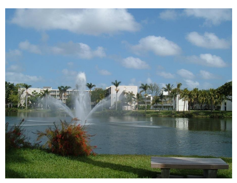
University of Miami