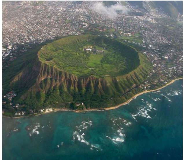
Diamond Head