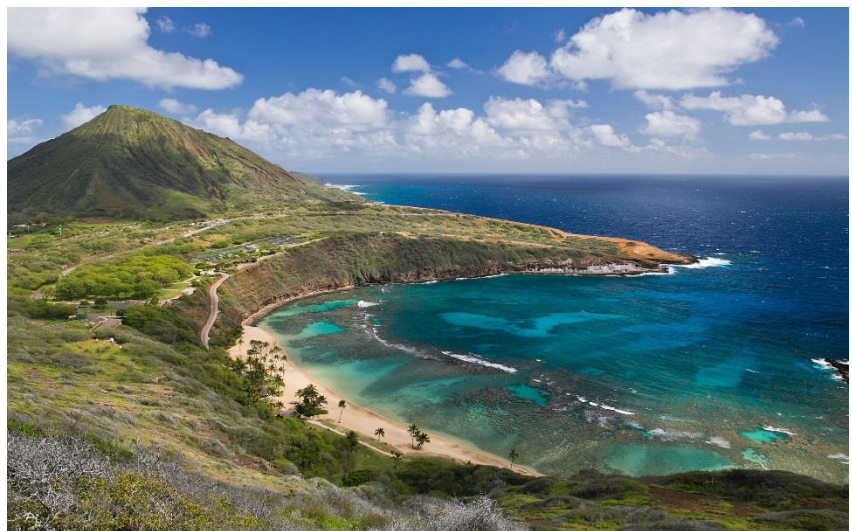
Hanauma Bay