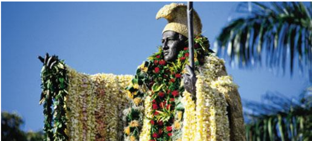
King Kamehameha

*If a holiday falls on a Sunday, the day following is observed as the legal holiday.