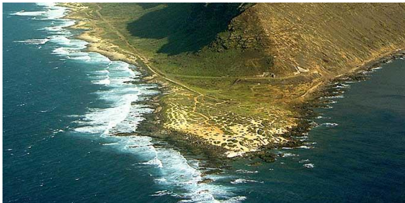
Kaena Point – Courtesy of ahola-hawaii.com