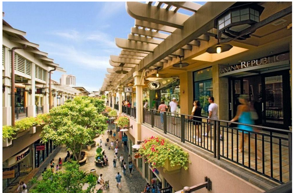
Ala Moana Center

Oahu is a shopper's paradise as well. You'll find everything from open-air malls ( Ala Moana Center is one of America's largest outdoor malls) and high-end retailers to charming boutiques and local specialty stores.