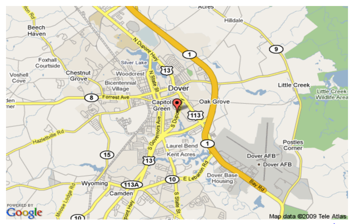
Map of Dover, DE