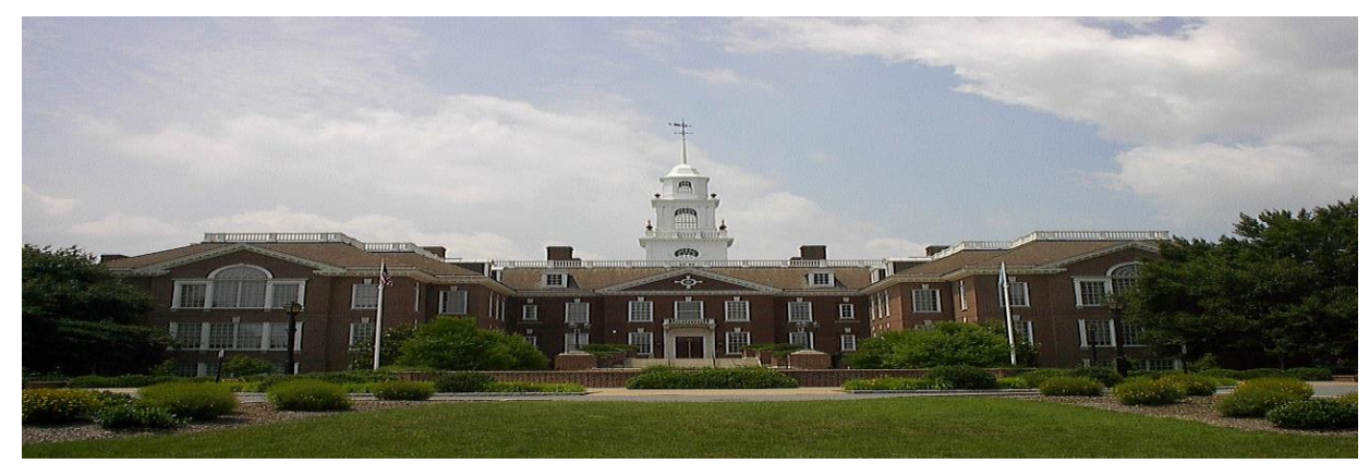
Legislative Hall in Dover, DE

The City of Dover is located in Central Delaware in Kent County and is the capital of Delaware. Dover is approximately 90 miles south of Philadelphia, PA, and 90 miles east of Washington, DC. While its population is significantly less than that of Wilmington, Delaware, Dover encompasses a larger area than any other city on the Delmarva Peninsula. In contrast to most major cities in the Northeast United States, Dover is continuing to grow economically, in population, and in land area. The City has an estimated population of 37,540 and a total land area of approximately 26,000 acres. Living in Dover, you will experience a vibrant downtown, a very attractive historical district and well established neighborhoods, as well as brand new subdivisions.