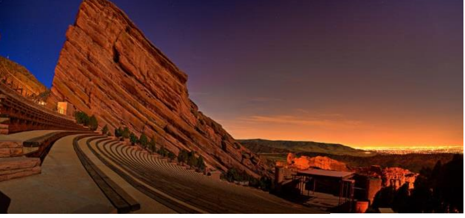
Red Rocks Amphitheatre

Denver Museum of Nature and Science: The Denver Museum of Nature & Science is a municipal natural history and science museum, and is a resource for informal science education in the Rocky Mountain region.