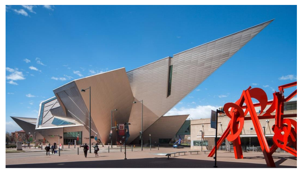
Denver Art Museum