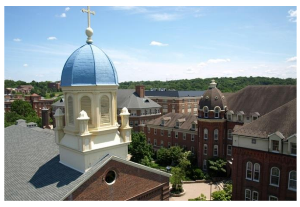
University of Dayton