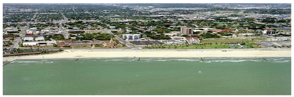
Magee Beach in Corpus Christi

Corpus Christi Texas is a coastal community with a beautiful bayfront and a first-class arts/museum district. Enjoy mild temperatures and lots of sunshine at the beautiful beaches. Nicknamed the Texas "Riviera", Corpus Christi is the fifth largest deep-water port in the nation, and one of Texas' most popular seacoast playgrounds.