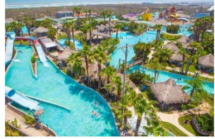
Corpus Christi Waterpark