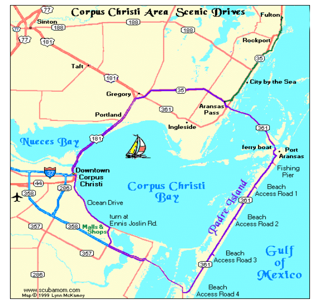
The Scenic Route