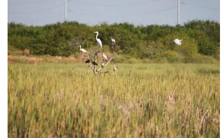
Oso Bay Wetlands