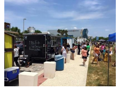
Local Food Trucks

Corpus Christi's melting pot is simmering with a foodie renaissance. While dependable favorites like scrumptious seafood platters, enchilada specials, old-fashioned diners, and down-home barbecue will never go out of style, fresh innovations emerge as award-winning chefs, farmers, mixologists and food-truck rockstars add to the spice of the local cuisine.