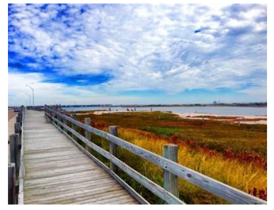
Corpus Christi Bike Trail

Call 1-800-352-5382 for additional information and cost. www.aaa.com