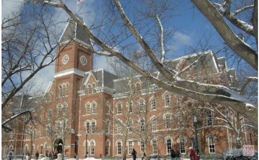
The Ohio State University