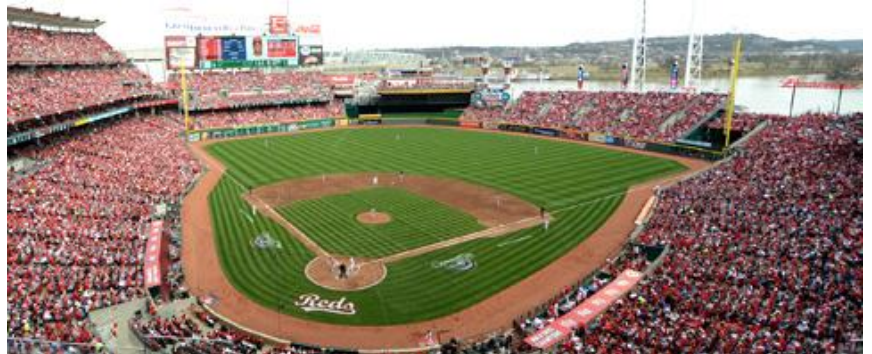
Great American Ball Park