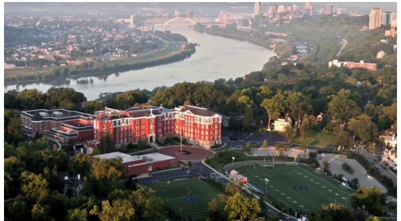
The Summit Country Day School

For a complete listing of private schools in Cincinnati, click here .