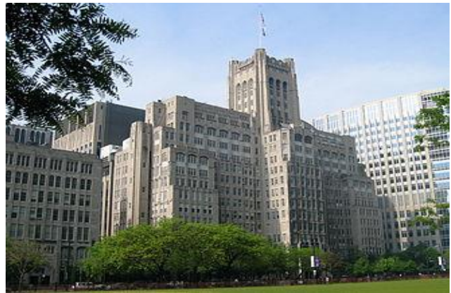
Northwestern's Feinberg School of Medicine in Chicago