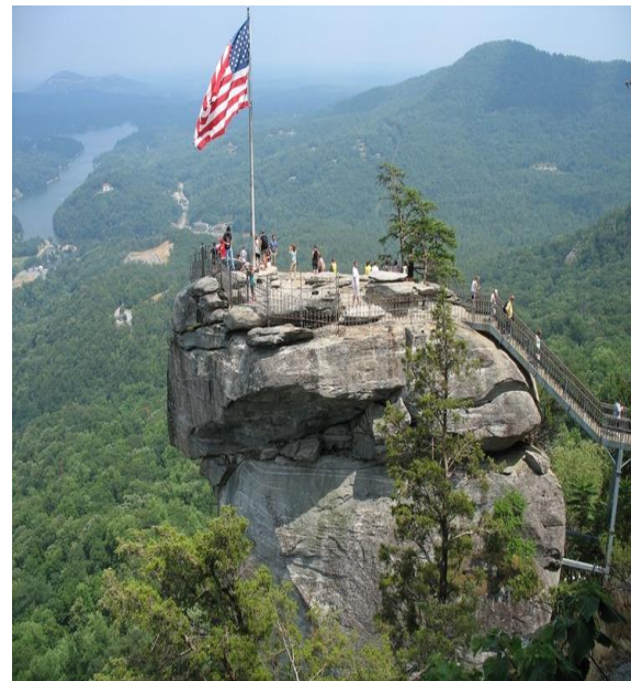
Photo of chimney Rock State Park