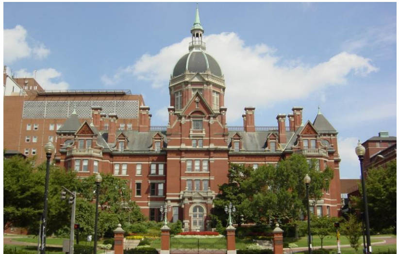
Johns Hopkins University