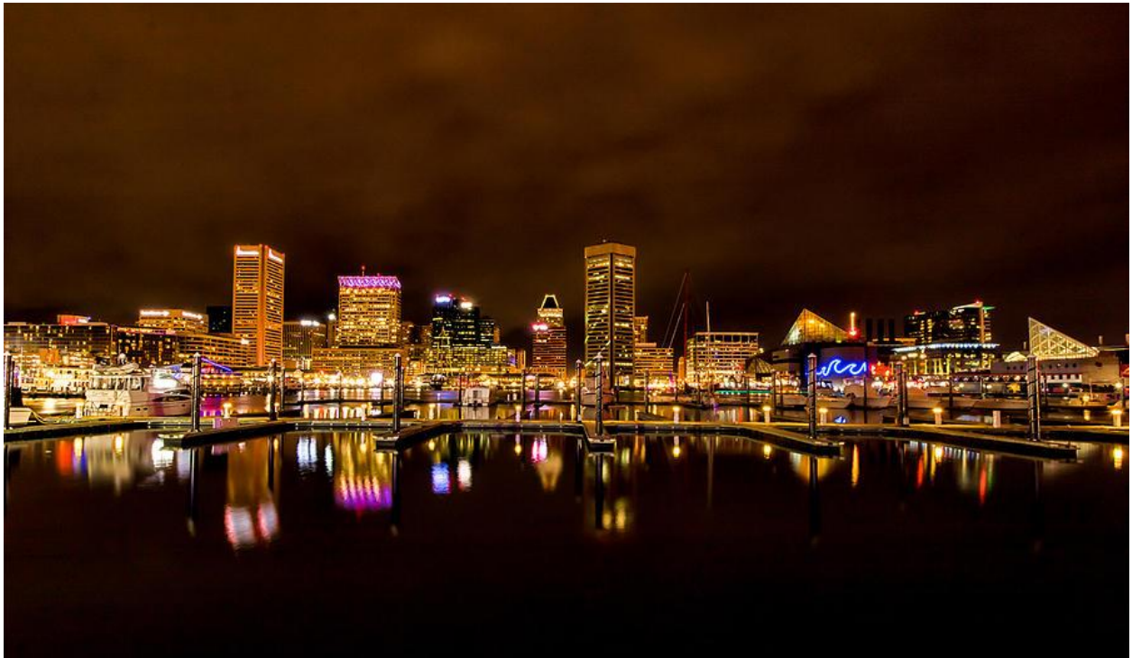
Baltimore Skyline at night

*If a holiday falls on a Sunday, the day following is observed as the legal holiday.