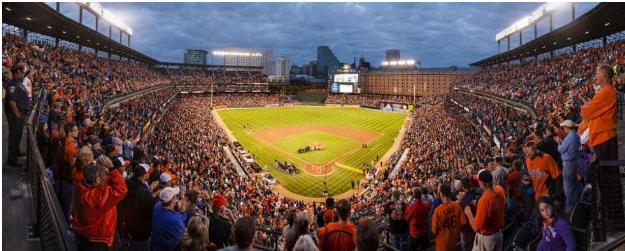
Oriole Park at Camden Yards

For other activities, Baltimore's parks offer places to hike, bike, or just relax with a picnic. Many of them also offer great space for family reunions. Federal Hill Park offers spectacular views of the Inner Harbor. Patterson Park features one of the city's iconic landmarks – a pagoda. Conservatories, arboreta, gardens and golf courses provide residents and visitors alike with beautiful spaces in public places.