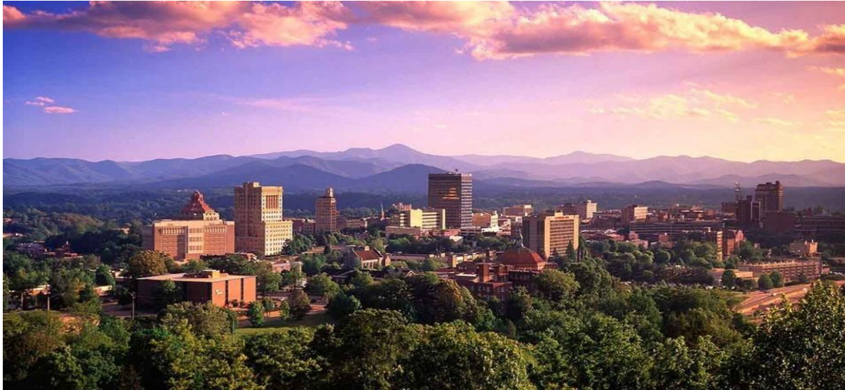
Photo of Asheville

Asheville, North Carolina is a splendid place, whether you're seeking beautiful mountain scenery, contemporary art galleries, fine organic cuisine, or outdoor adventures. Located within the scenic Blue Ridge Mountain range, this city is full of American treasures. Known as an art colony, a healing resort and a home to notable statesmen and luminaries, Asheville is one of the most welcoming, vibrant cities in America. The city's rich architectural legacy, with its mix of Art Deco, Beaux Arts and Neoclassical styles, is the perfect backdrop to the energy that emanates from the locally owned-shops and galleries, distinctive restaurants and exciting entertainment venues. Your activity choices include strolling through downtown Asheville's many art galleries, whitewater rafting on a clear mountain river, visiting craftspeople in their studios, hiking on one of 75 trails in the area, exploring some of the 100 antique shops, or just relaxing over a refreshing drink at one of many local coffeehouses or sidewalk cafés.