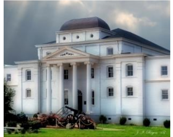
Wilkes Heritage Museum

For more information on Asheville attractions or to schedule a tour , visit Explore Asheville .