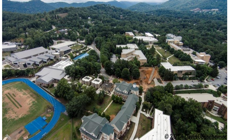
University of North Carolina Asheville